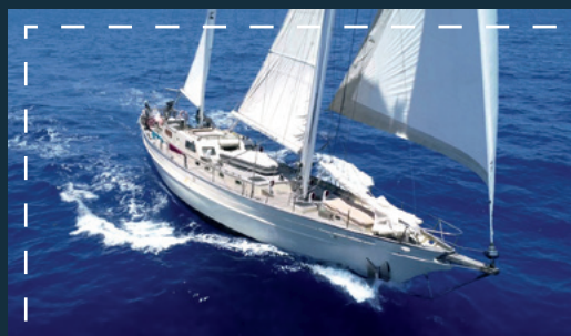
LA PEREGRINA (GERMAN FRERS 72)

REQUEST EXPERIENCE / Previous coastal and night navigation advised