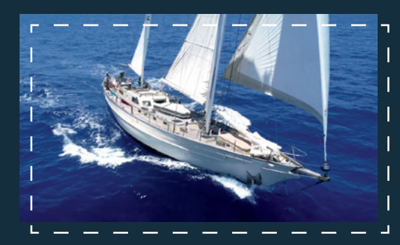
LA PEREGRINA (GERMAN FRERS 72)